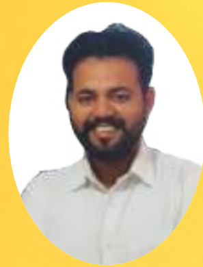
Baljinder Singh Punjab Govt.