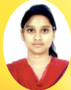
Seema Punjab & Haryana High Court