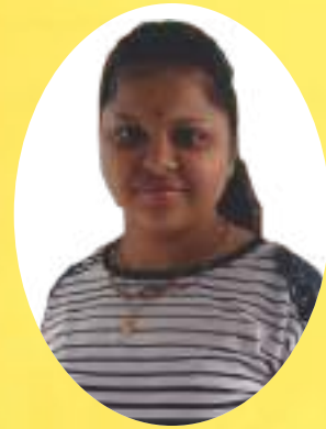
Bandhana DAV College Chd.