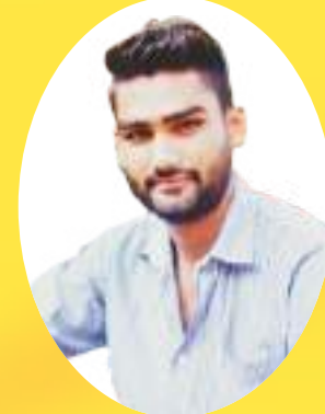
Amrinder Singh Punjab Govt.