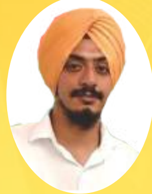
Prabhjot Singh Punjab Govt.